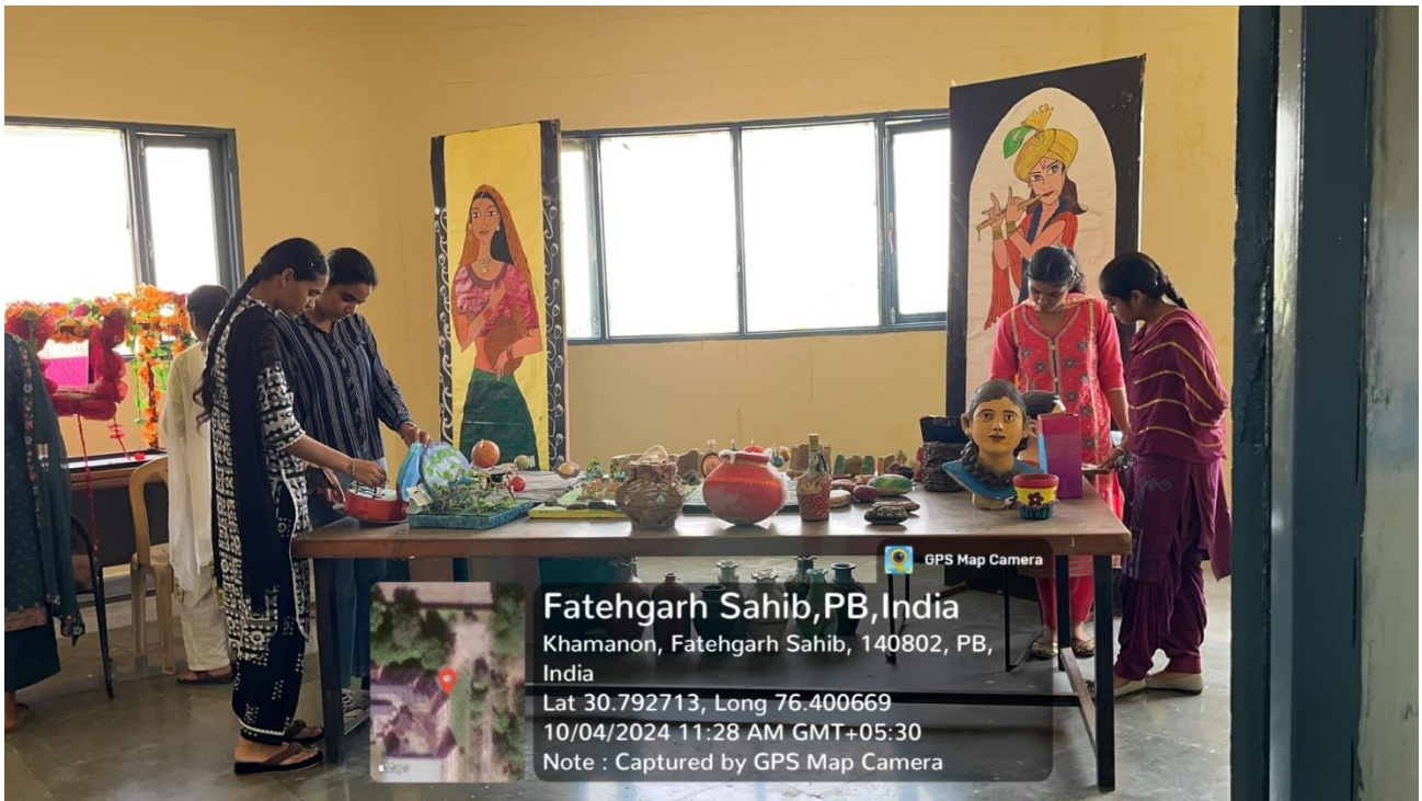
Art and Craft Resource Center