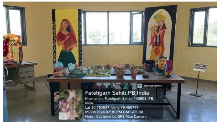
Art and Craft Resource Center