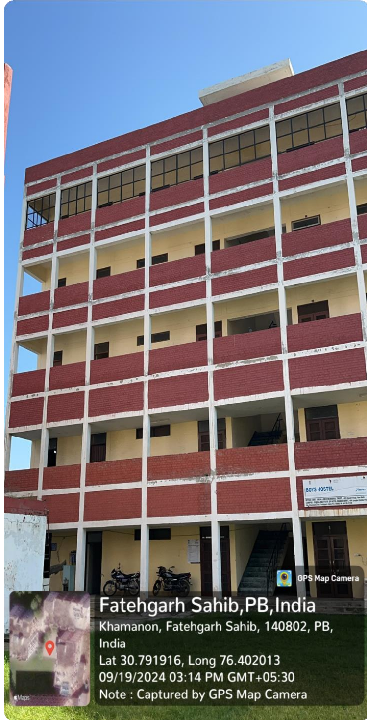
Hostel Side View