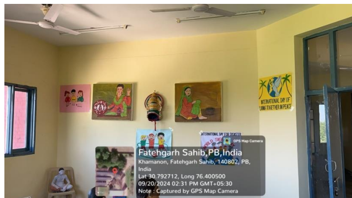
Art and Craft Resource Center